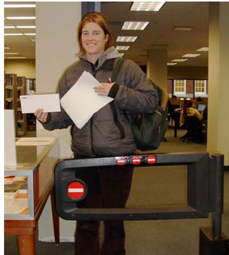
Our 1,000,000th visitor enters SAIT Library