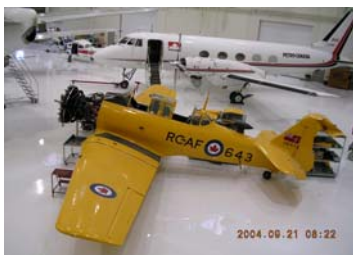
AeroCentre Hangar

In October, we added 15 new databases to our Electronic Resources collection. The new databases include several specialized ones in the health, legal and business areas and also some very broad-based ones. Most of these databases are from the Subscriptions Alberta Ebsco product grouping.