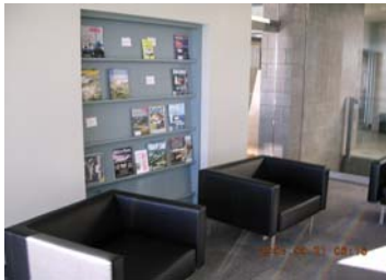
Reading Room

In September, the aviation programs at SAIT moved to a new building near the Calgary International Airport. The new Art Smith Aero Centre has a library. During the summer, library staff packed up the books, journals and videos dealing with aeronautics and delivered them to the Centre. The new library has 3 rooms: a reading room, a study/exam room with study carrels and computer workstations and a room that houses the collection. Students and staff may also request material from the main library through our Intercampus Loan service. There is currently no library staff at this satellite location but we are asking for funding for a library staff member to provide services at both the Art Smith and Mayland Heights campuses in 2005.